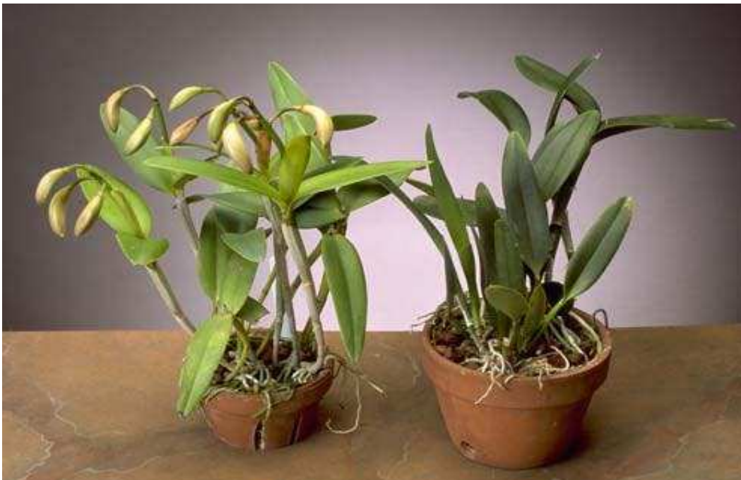
Submitted by Jay Loeffler

When growing cattleyas try to keep the growing tip of the rhizome toward the light.