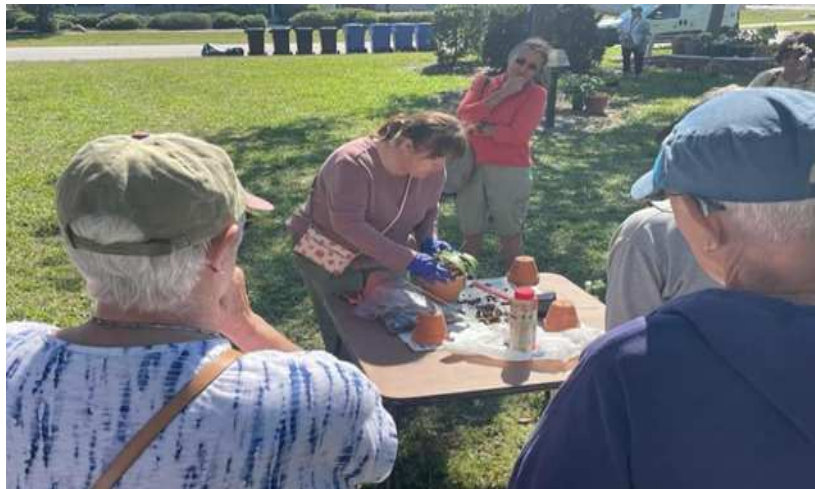
Member Plant Sale Blalock Park March 24th