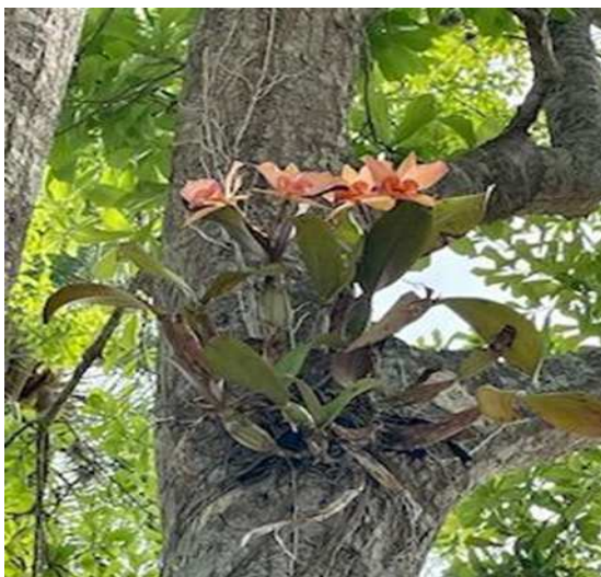
Venice Orchid Project Blalock Park