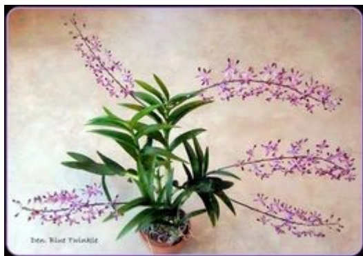
Den. Blue Twinkle Cynthia Vance