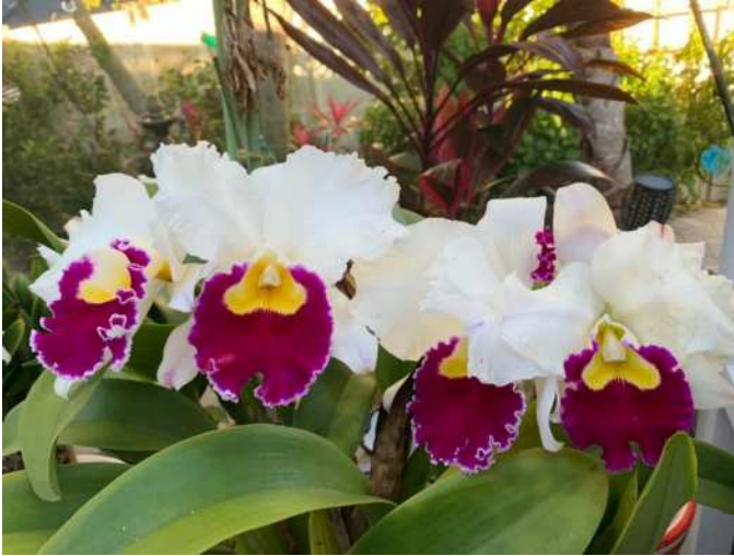
Winner: JoAnn Glazewski NOID

We had a great collection of beautiful plants in our Virtual Plant Table Contest! After each monthly meeting a post will be placed in the VAOS Facebook group where members can post a photo of their currently blooming plants. Winners will receive a gift certificate to one of our show vendors. Come join the fun!