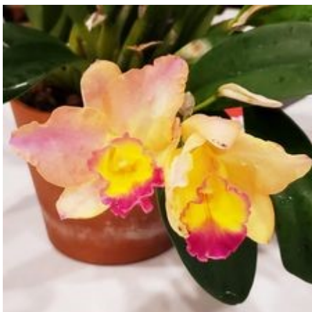
Ian Kennedy, Rth. Eye Candy 'Mellow Yellow'