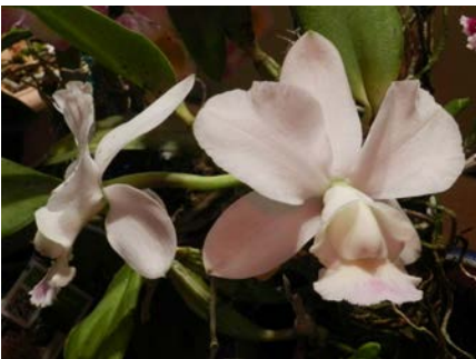
Grower: Bob Wallace

This is a beautiful clone of a well-known species. You have to look closely at the lip to see a light pink coloring on an otherwise pristine white flower. Cattleya walkeriana is a small growing species from Brazil. It has been used to breed showy, flat, full, small Cattleyas . In addition, it has been line breed in many color forms. The color form of the clone shown by Bob Wallace is not commonly seen in our area.