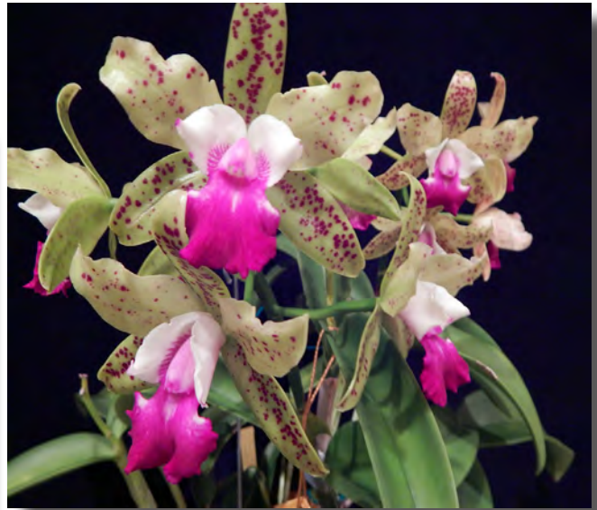
Lc. Adelaide Waltman x C. Landate