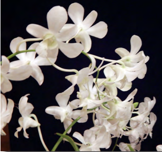
Den. Emma White

First Place Ribbon: Dendrobium Emma White grown by Debi Wolfe. It is one of the best known trade names in orchids. Debi's plant was huge -- at least 4 feet tall and 3 feet wide. Congrats Debi!!