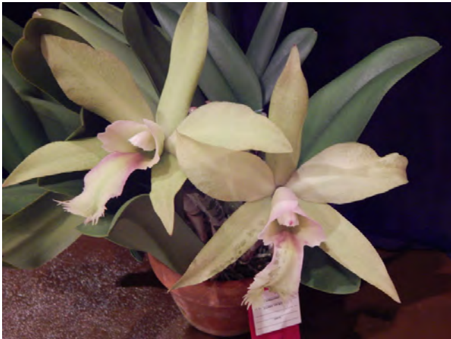
Blc. Hemlock Pass x Lc. Ann Follis