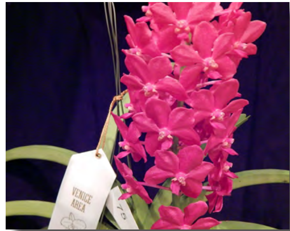
Van. Roll on Red