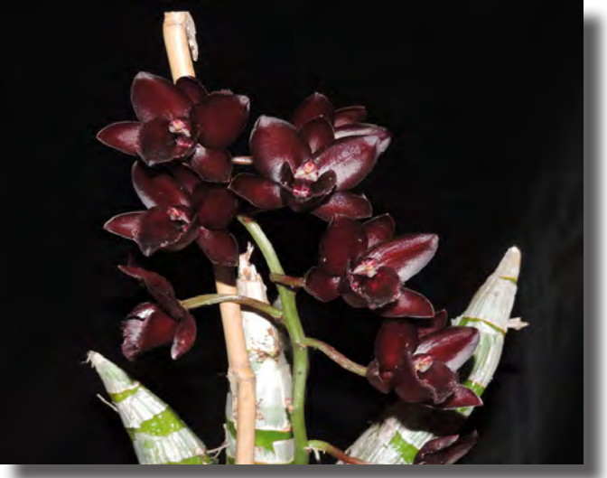
Fdk. After Dark

first saw this plant in 2004, their award description stated, "this was the blackest orchid the team had ever seen." The After Dark (Mo. Painted Desert x Ctsm. Donna Wise) cross has produced many plants with very dark flowers,