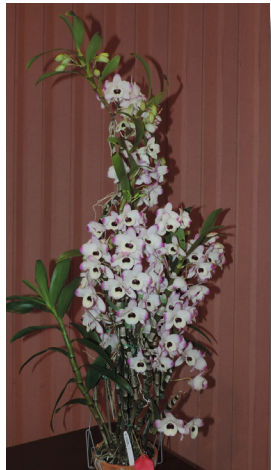
Den. Upin King 'Serenade'

see these plants for sale at Home Depot or Lowe's. They require high humidity, bright indirect light, daily watering while in active growth and must dry out quickly. Their leaf span rarely exceeds 6-8". They are commonly grown in 2" pots and a 4" pot can be a specimen. Nice plant Jimmy!