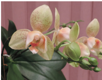
Phal. Memoria Regina Busse