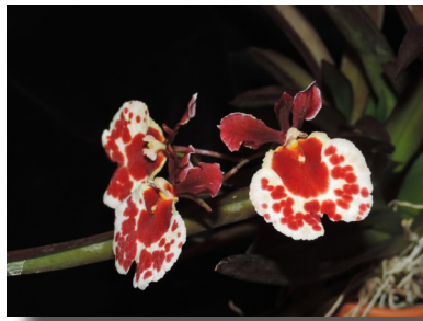
Rrm. Windsong x Tolu. Elfin Star