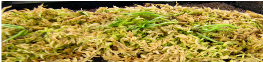
Seedlings at 4 months

Their home is a plant growth chamber called a PhotoTron, or the GhostArium, as Cynthia Vance likes to call it. It's specially designed to grow plants in sphagnum moss and the temperature, light and humidity are easily (?) regulated with a bit of ingenuity and trial and error. The PhotoTron only produced humidity of 45-50%, so I added a cool mist vaporizer to raise the