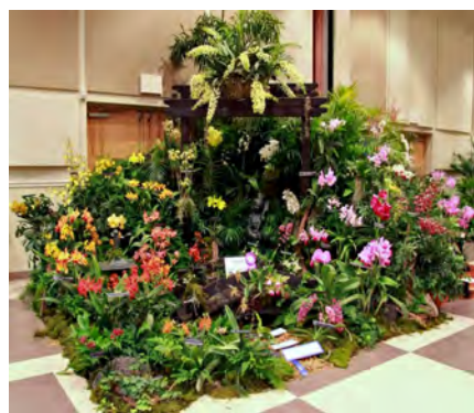
Membership Table and Art Stone-Palmer Orchid Display – Photos by Robert Shainline Photography&Video Svcs., www.AllAboutEnglewood.com