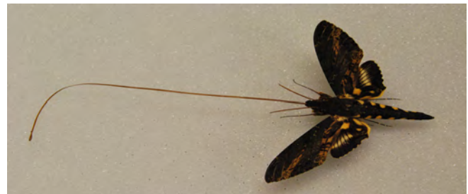
Giant sphinx moth