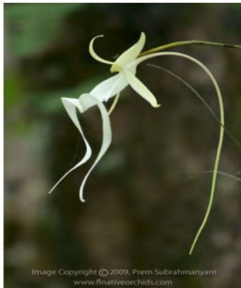
Ghost Orchid, with permission, all rights reserved

What are they? Where do they grow? What do they need to grow? Where can I get them? These are only some of the questions I asked myself when I started a few months ago.