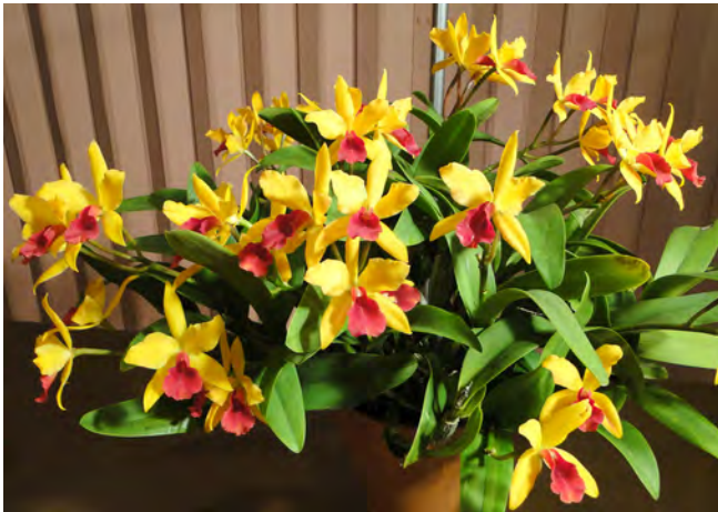
Eplc. Gold Digger 'Orchid Jungle' HCC/AOS