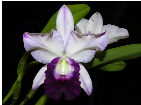
Cattleya Memoria Robert Strait 'Blue Hawaii' JC/AOS