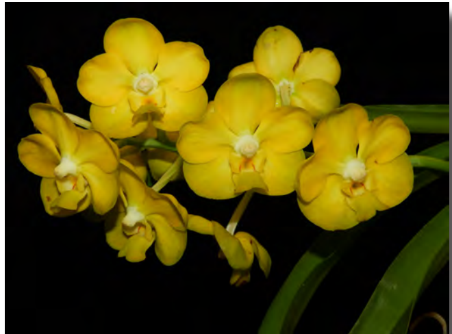
Vanda Udomchai Harvest Moon x Vanda Kenny Gold