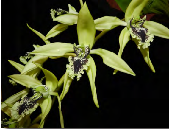
Coelogyne South Carolina