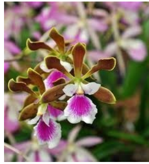
Enc. tampensis x Enc. randii