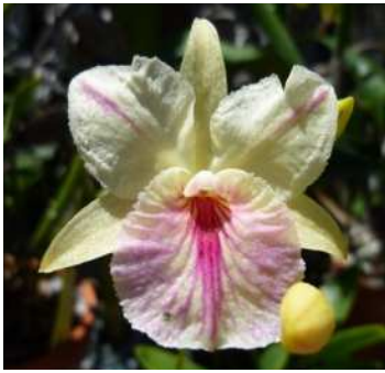
Bro. sanguinea v. aurea x Bro. sanguinea 'Star Splash'