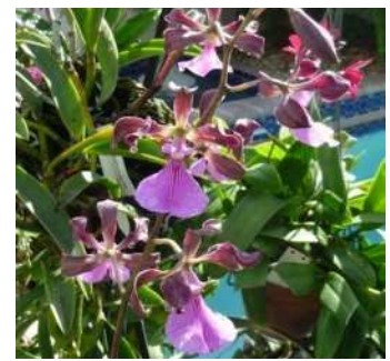
Enc. Gay Rabbit

If you have enough orchids, you will always have something in bloom. For those of you with smaller collections who yearn for flowers during the hot summer months, consider encyclias and broughtonias.