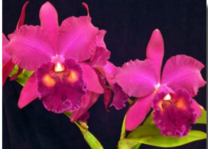
Rlc. Walnita Char