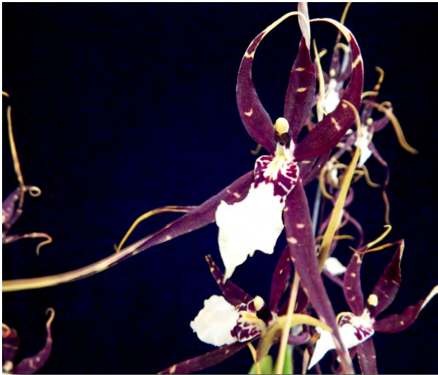
Brat. Kauai's Choice

The First Place Blue Ribbon was awarded to Donn Smart for his beautiful Bratonia (Brat.) Kauai's Choice , previously known as Miltassia (Milt.) The plant was registered by Yamada Nursery in 1998 and is a cross of Brassia (B.) arcuigera and Bratonia Aztec . The plant displayed three erect inflorescences, each displaying many typical spidery Brassia type flowers with long thin purple petals and an elongated white broader lip. Since neither of the parents display the prominent purple color, it is likely that it comes from its Miltonia ancestors. The plant can bloom multiple times throughout the year, with flowers lasting up to six weeks, depending on climatic conditions. Thanks, Donn, for sharing such a beauty!