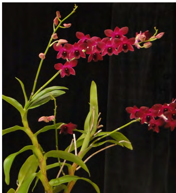
Den. Princess Misaki