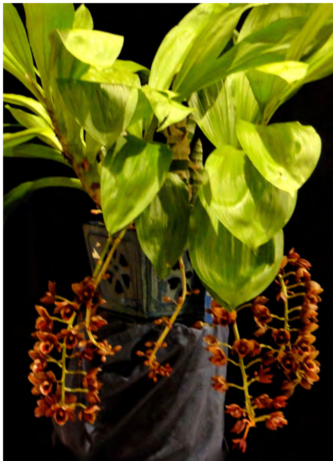
Fdk. After Dark