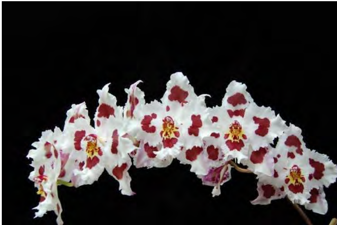
Odontoglossum Teresa Heinz Kerry 'Solar Place' AM/AOS