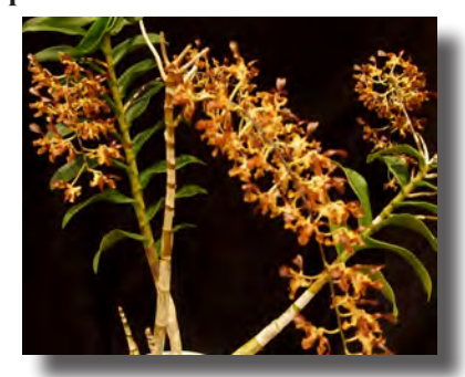
Den, discolor x undulatum

Aldridge for her Den. discolor x undulatum. It was a stately plant of 5 inflorescences with more than 100 flowers. What does "discolor" mean? It can mean the faded color of the flower and here it points to the lovely light brown and white of