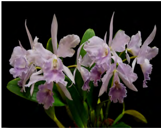
Rth. Lois McNeil