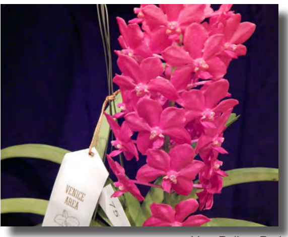
Van. Roll on Red