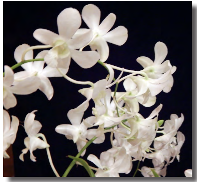
Den. Emma White

First Place Ribbon: Dendrobium Emma White grown by Debi Wolfe. It is one of the best known trade names in orchids. Debi's plant was huge -- at least 4 feet tall and 3 feet wide. Congrats Debi!!