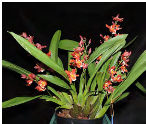
Wils. Pacific Panache

The First Place ribbon went to Wils. Pacific Panache