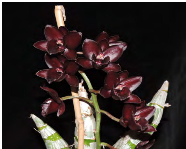
Fdk. After Dark

first saw this plant in 2004, their award description stated, “this was the blackest orchid the team had ever seen.” The After Dark (Mo. Painted Desert x Ctsm. Donna Wise) cross has produced many plants with very dark flowers,