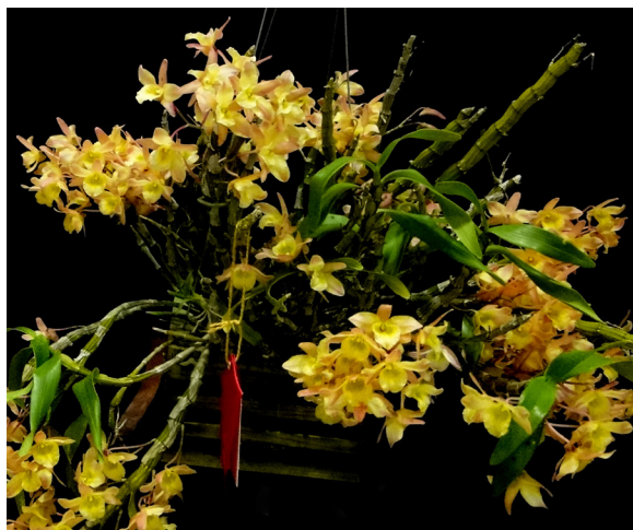
Den. Spring Bird