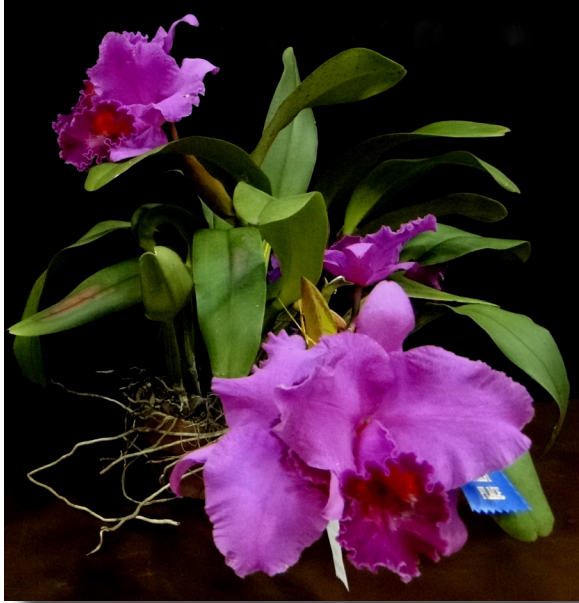
Rlc. Memoria Grant Eichler