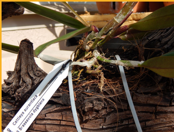
plastic cable ties