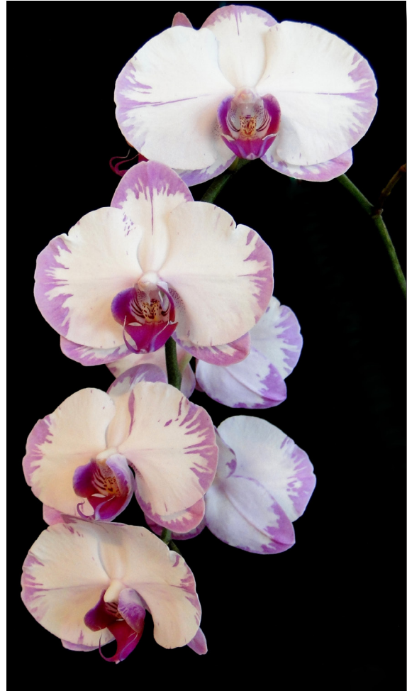
Phal. Champion Lightning