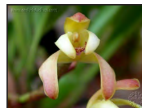
Maxillaria leucaimata Barb.Rodr.

Many orchid societies give to OCA. OCA donated $30,000 in 2013 to expand Reserva Serra Bonita in the southern part of Bahia, Brazil. Run by the Instituto Uiraçu, the reserve is projected to eventually encompass 18,000