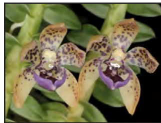
Dichaea pendula (Aubl) Cogn.

in the future. We are able to do this because you, our members, make VAOS a financially secure society -- through your donation of time (volunteering) or money (being a patron) for our annual orchid show. We look forward to your participation again in our upcoming "Orchid Paradise" show. Thank you!