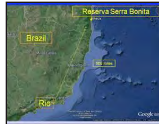
Reserva Serra Bonita

to this article, that VAOS is preserving forever.