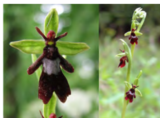
The Fly Orchid (left) Scientific Name: Ophrys insectifera Habitat: Europe The Dove Orchid (right) Scientific Name: Peristeria elata Common Name: Holy Ghost Orchid Habitat: Central & South America