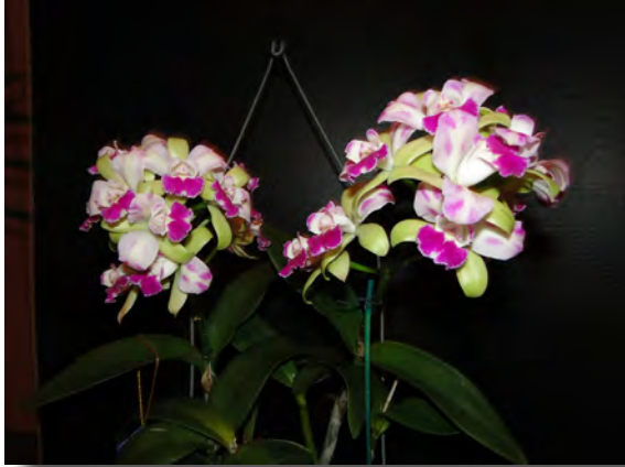
Bc. Penny Helen 'Kudos' HCC/AOS