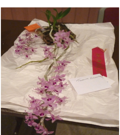
Den. Pearly Shells

It appears that the grower of the orchid earning third place and member's choice is unsure of the name of their plant. It was labeled Dendrobium Blue Fairy or unnamed Hawaiian Dendrobium. The card did not have the growers name on it. We believe the plant is Den. Blue Fairy. It was really nice and well bloomed. Its parents are Den. Corinne Le Hovelleur x Den. Udom Blue Angel. Will the grower of this plant please identify herself.