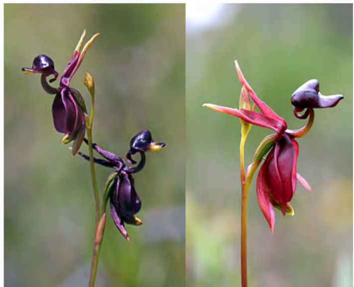
'Flying Duck Orchid' - Caleana Major Habitat: eastern and southern Australia