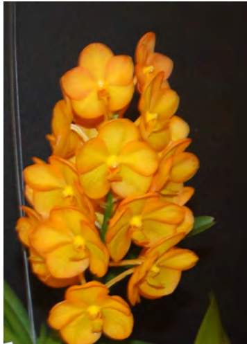
Vanda Ladda Gold

Fahrenback. This plant is an Ascocenda (Ascda.) now classified as vanda. It is a cross of V. Tubtim Velvet x V. Bangkhuntian Gold. Peg notes that she purchased two of these plants from Palmer in 2012. One blooms gold and the other yellow/orange. Peg's husband, Bill, constructed a special hanging rack on their pool deck for her vandas and mounted cattleyas. They clearly are very happy there. Good growing, Peg!