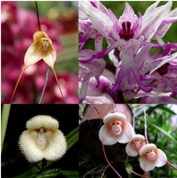
'Monkey Orchid' - Dracula Simia & Orchis Simia Habitat: southeastern Ecuador and Peru