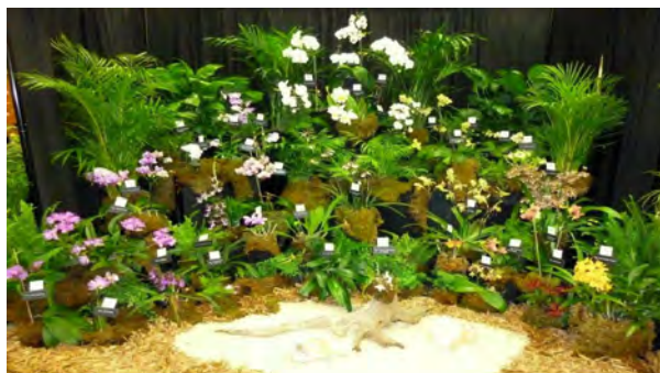
exhibit that took the 2nd place award for Best Exhibit. Ten blue, seven red and nine yellow ribbons and two trophies were awarded by AOS judges as follows: