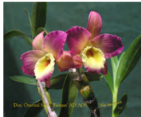
Den. Oriental Smile 'Fantasy' AM/AOS