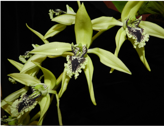
Coelogyne South Carolina