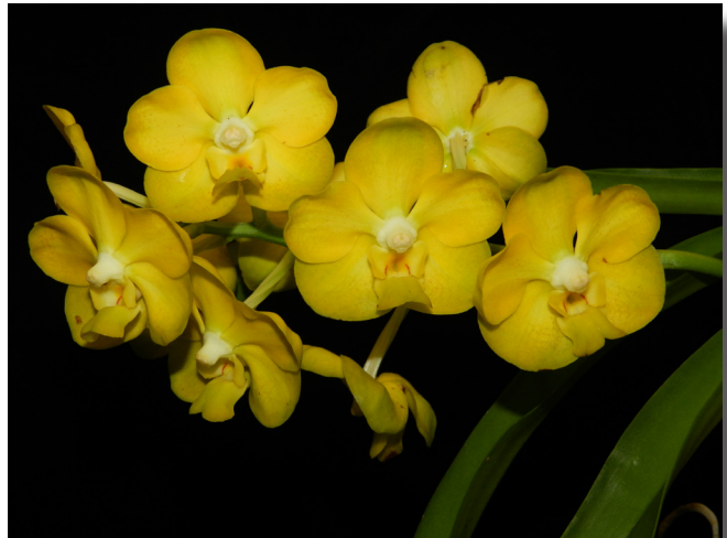
Vanda Udomchai Harvest Moon x Vanda Kenny Gold