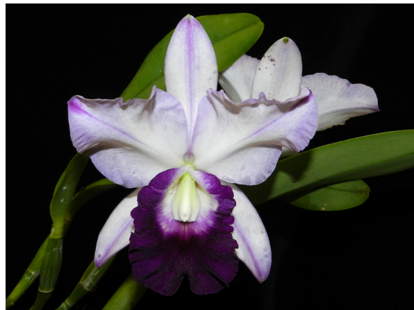
Cattleya Memoria Robert Strait ‘Blue Hawaii’ JC/AOS